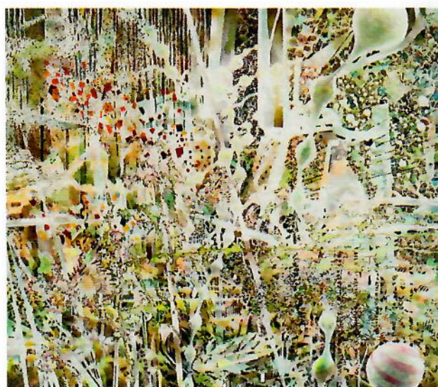
Alchemist's Garden (Predna Zone) , 2006, acrylic and graphite on paper, 21" x 23.5" matted. Courtesy of the estate of David Omar White. Photography by Robert Hakalski