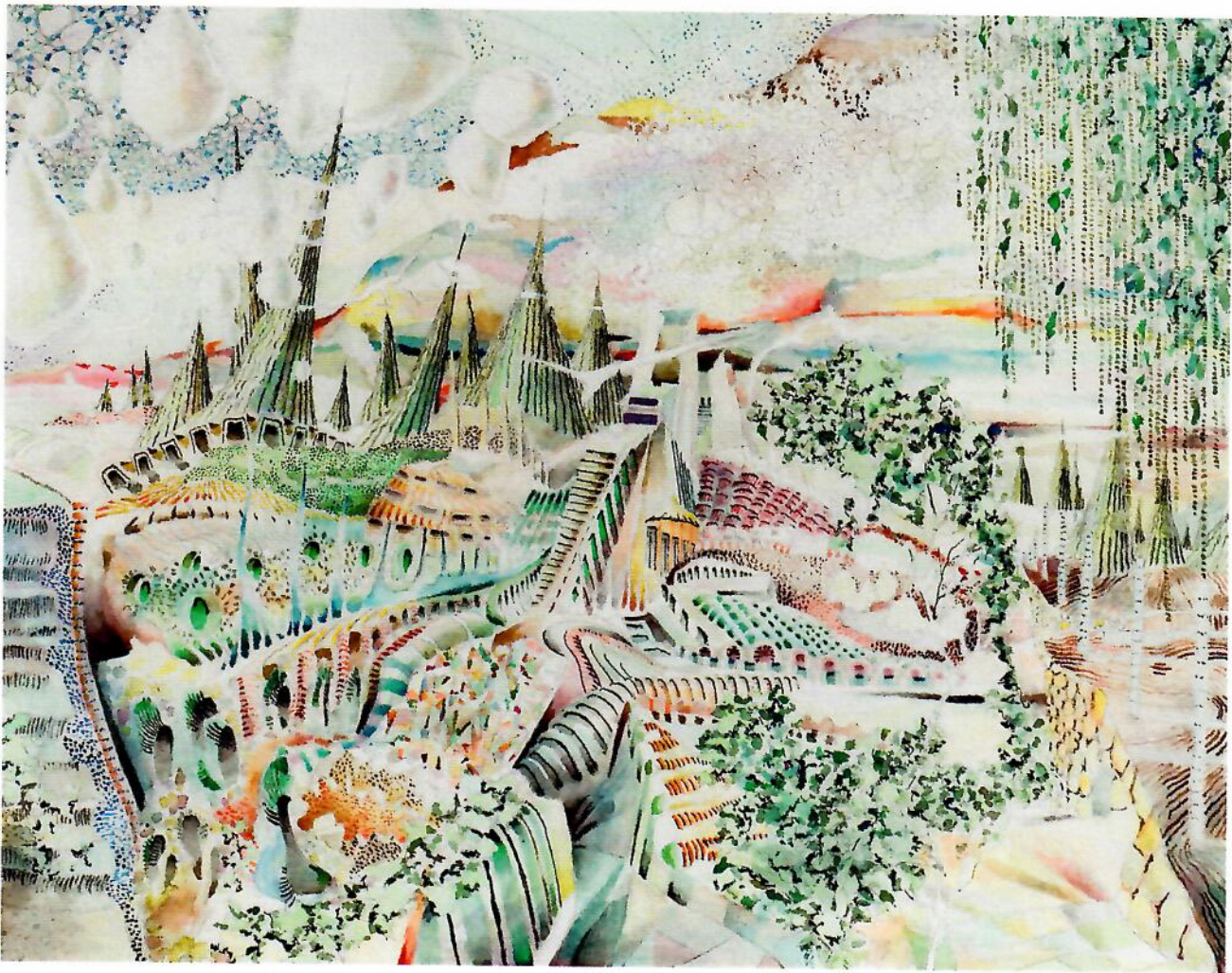
I Dreamt about Fatehpur Sikri , 2006, acrylic and graphite on paper, 19.375" x 24" matted. Courtesy of the estate of David Omar White. Photography by Robert Hakalski