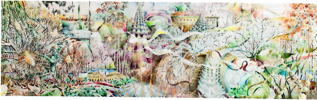
Mini Mural #11 (Umbria) , 2008, liquid acrylic and graphite on paper, 20" x 60".